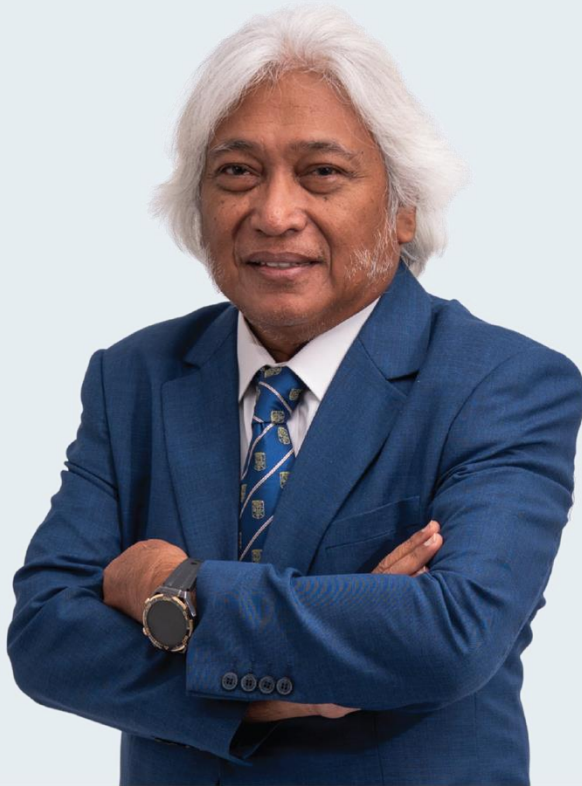
TAN SRI MUHAMMAD IBRAHIM Chairman